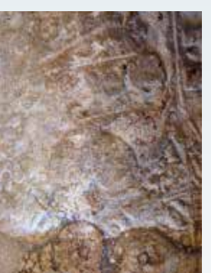
16. Gules three water bougets Argent. The Arms of the Ros Lords of Helmsley Though somewhat damaged it

is just possible to make out the shapes of the water bougets.