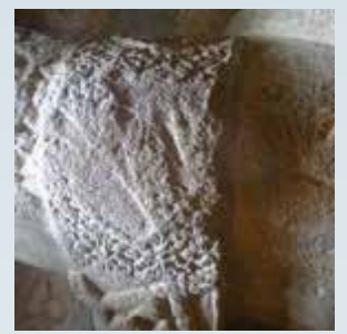
4. A bend Unidentified