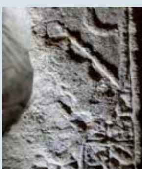
7. On a bend engrailed cotised a crescent for difference (i.e. for a second son.) Unidentified