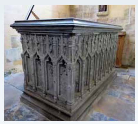
Tomb of the 4th Earl of Northumberland, d.1489

The most obvious existing link between the Minster and the Percys are the two remaining tombs. The famous and beautiful one beside the High Altar belonged either to a mid 14th century Percy wife, one of the two named Eleanor or maybe Idonea, a name of which even the pronunciation is unresolved, or even a Percy priest, Dawton's preferred choice.