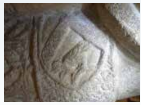
3. A chevron, in base, a bird. Unidentified