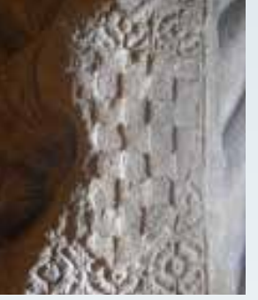
8. Chequy Or and Azure Warenne, Earls of Surrey