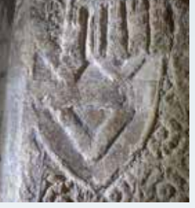
18. A Fesse between three chevrons reversed. Unidentified

17. "A chevron between three escallops." There are two local possibilities: "Argent a chevron between three escallops Gules." Tankard (Tancred) of Boroughbridge. 14th century. Sable, a chevron between three escallops Argent." Favell of Burnsall, Normanton