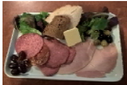
The Monk - a meal for one: £8.95

Vegetarian and vegan options always available