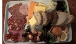
The Abbot - a sharing platter or for one dedicated appetite: £12.95